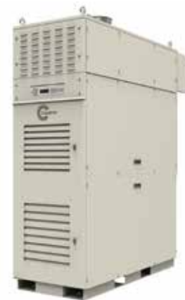
C65 ICHP Microturbine