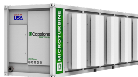
A C1000 Microturbine provides up to 1 MW of electrical power and contains five microturbine engines.