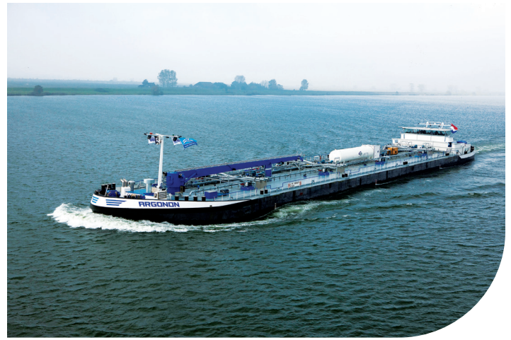
Two liquid natural-gas fueled Capstone C30 MicroTurbines onboard the MTS Argonon Type C tanker in Rotterdam, Netherlands, operate in an N+1 setting and serve as the main electrical power supply.

meet strict emission regulations without additional exhaust aftertreatment. The result is a tremendous reduction in service requirements, maintenance, and operational costs.