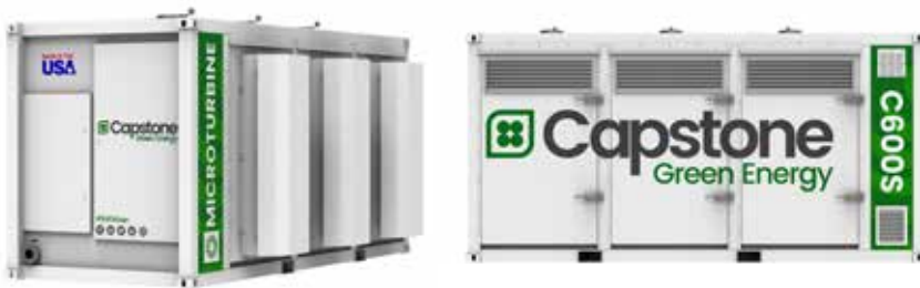
C600S Power Package

The Signature Series Microturbine provides 600kW of reliable electrical power in one small, ultra-low emission, and highly efficient package.