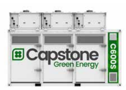
C600S ICHP Power Package