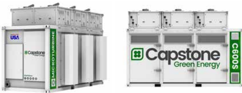
C600S ICHP Power Package

The Signature Series Microturbine provides ultra-low emissions and reliable electrical/thermal generation from natural gas.